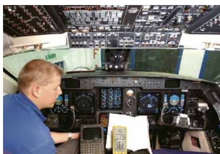
Modification and Retrofit