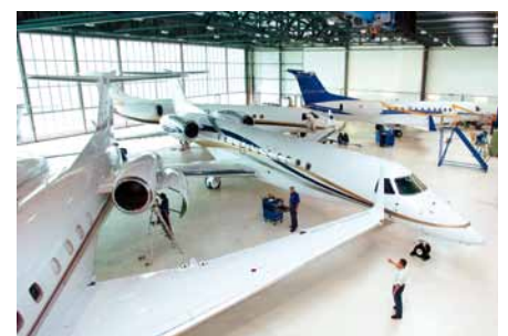
CAMO and Fleet Management