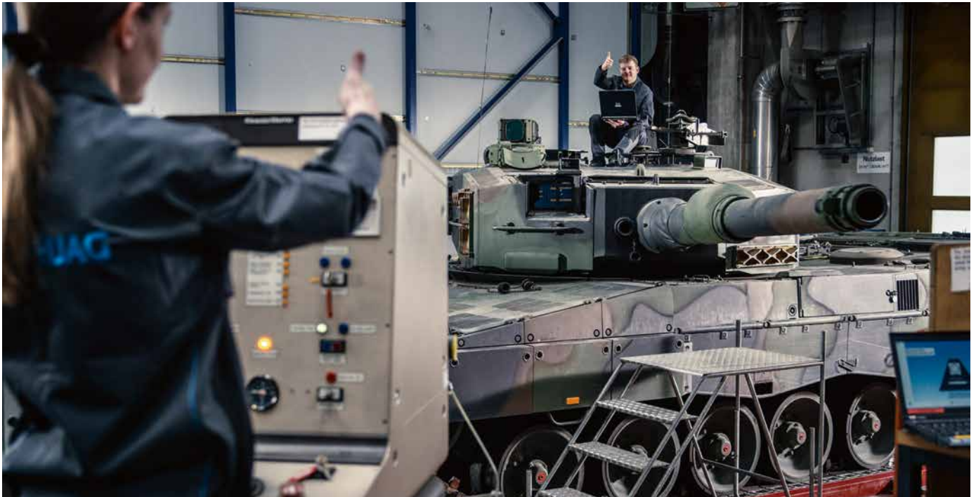
Verification after MRO services have been carried out