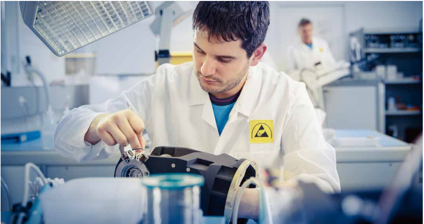
Overhaul optronical components