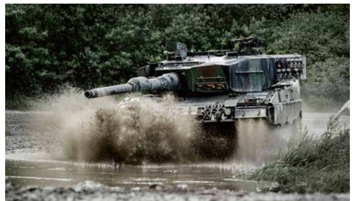
Leopard 2 WE (Swiss Upgrade)