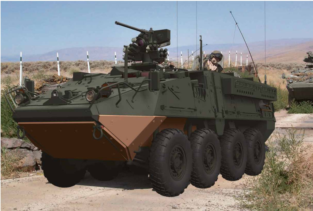
SidePRO-KE/IED as solution for wheeled vehicles