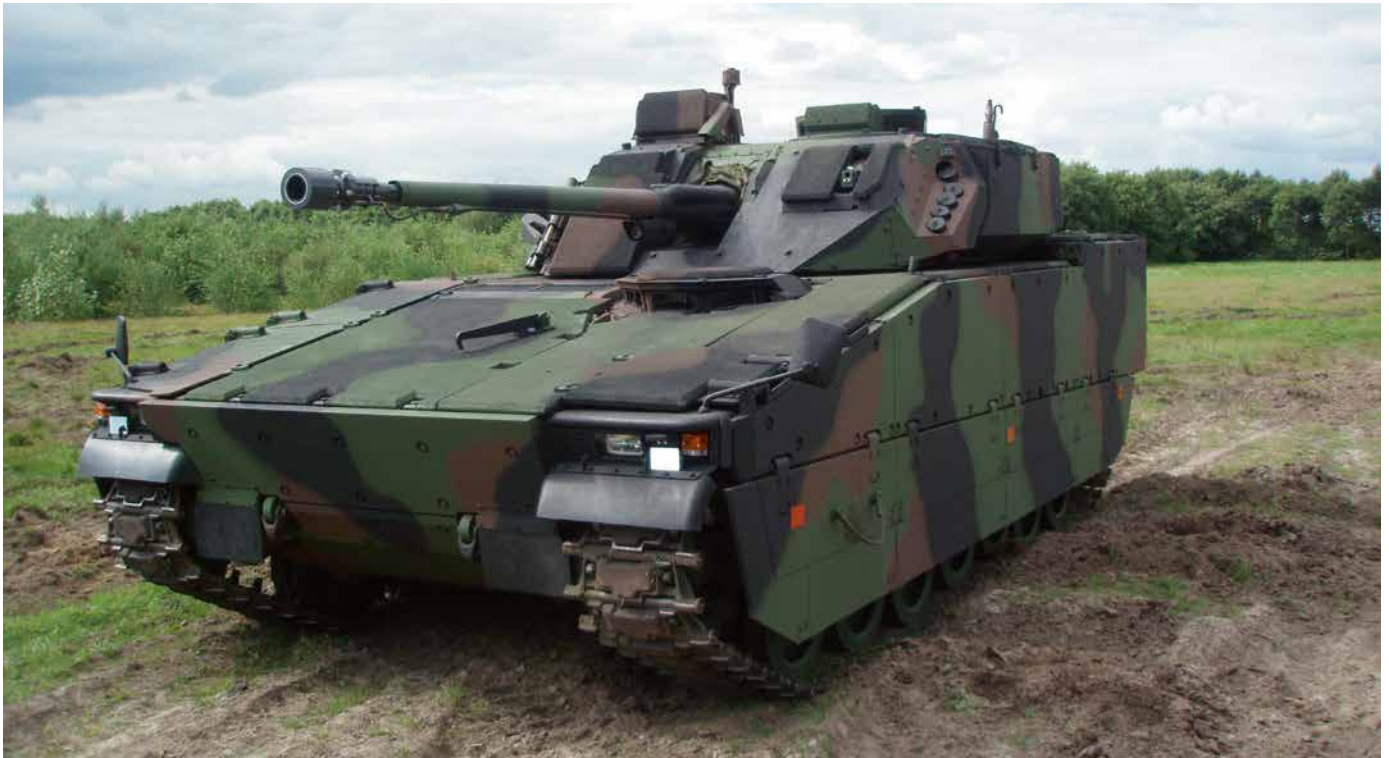
CV9035 NL with RoofPRO-P