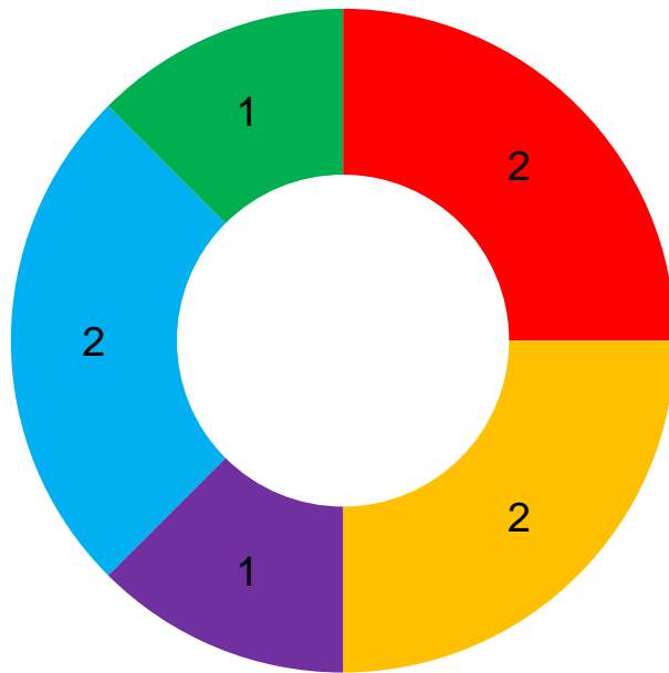
Categories of allegations