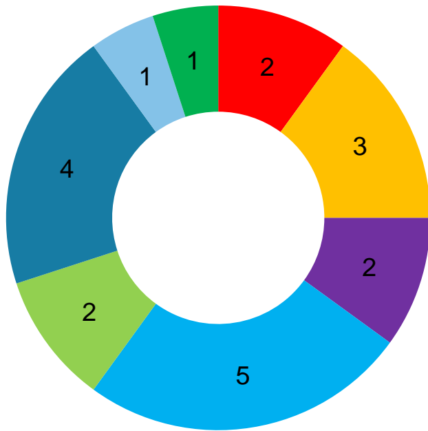
Categories of allegations